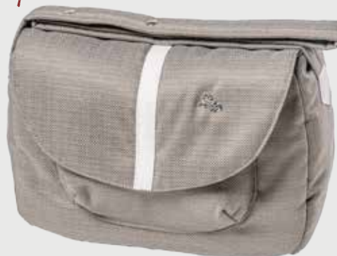
Illustration leather stripes / Dimensions: B40xH28xT15 cm

The changing bags are available in the exterior colour of the pram, have a changing mat, small inside pockets and can be carried as shoulder bags. They are available as rectangular or rounded models.